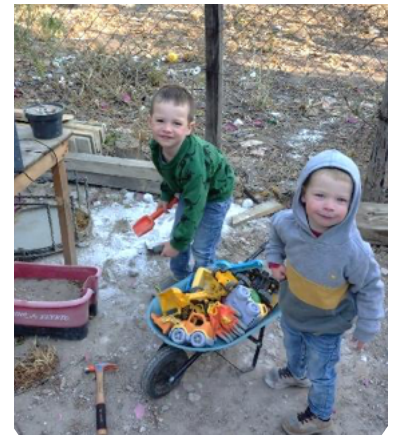
We have two enthusiastic helpers for our house projects.