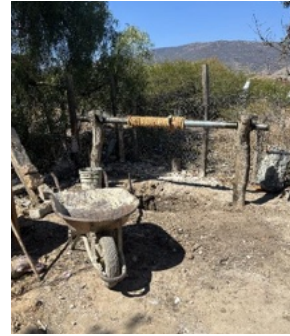
"We're digging a well!"