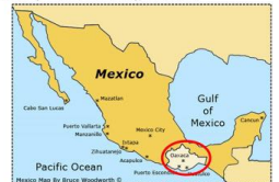
Oaxaca (wah-HAH-kah), Mexico