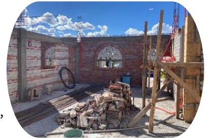
1 & 2