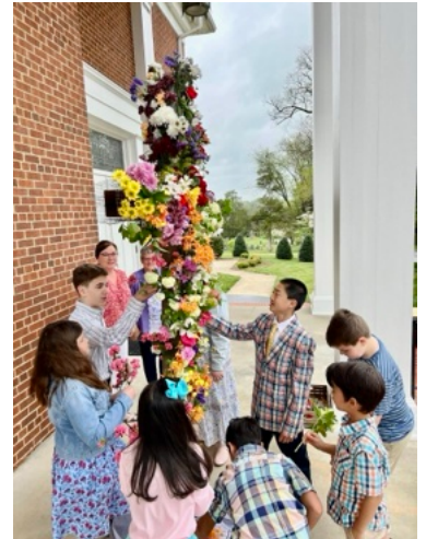
Easter Egg Hunt and Decorating the Flower Cross