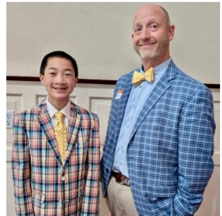
“Who wore it better?”

Come early. Stay late. Tell your friends.