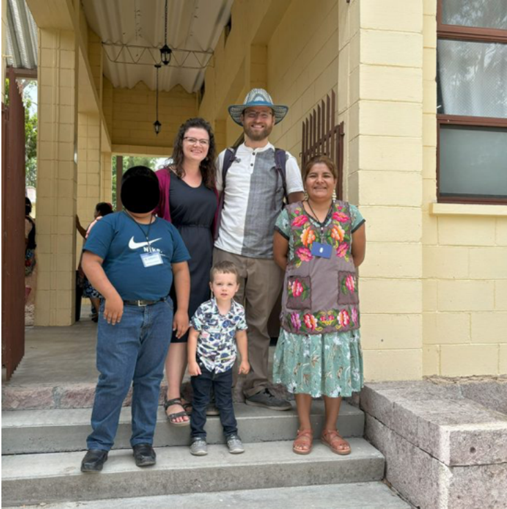
With Sandy and her nephew, our two participants at last year's Basic Writers Workshop.